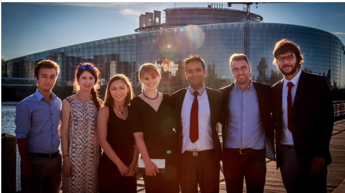
Greetings from the EMPA Executive Board 2016-2017

Copyright © 2016 European MD/PhD Association, All rights reserved.